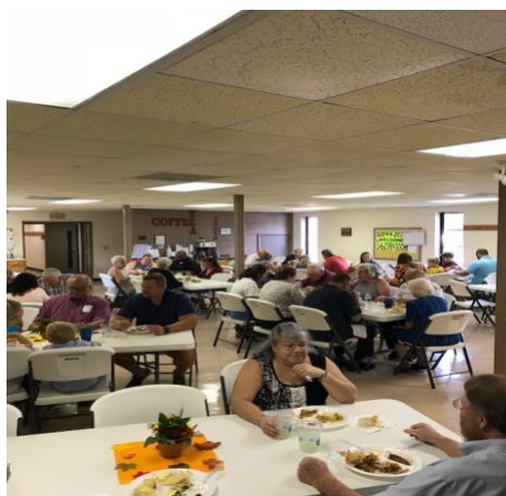
(A Full Fellowship Hall for PUMC 5th Sunday Agape Meal)