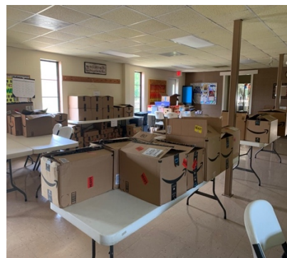
Back to School

Trivia answers: 1) 66 2) Judith 3) Mark 4) Acts 5) Jude 6) Torah 7) Romans