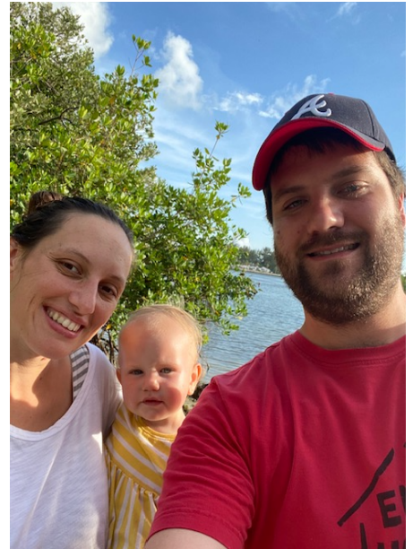
We Love you Pastor and your precious family.